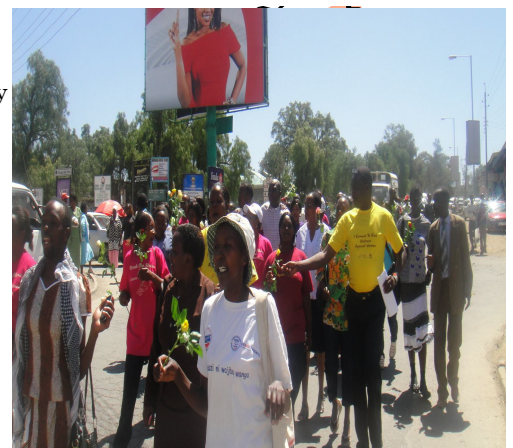
Naivasha GBV/FGM/C Working group members in a procession during the International Women's Day

The IWD was a huge success as apart from celebrating the gains for women, it