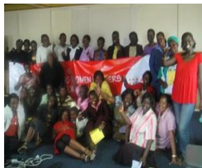
Women Leaders in Naivasha pose for a group photo

The women took the challenge of spearheading a campaign against SGBV & FGM/C in their work and further planned to organize sensitization forums. The leaders accented on the challenges women experi-